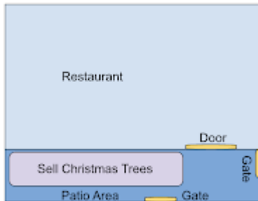
Site Plan.png 30K