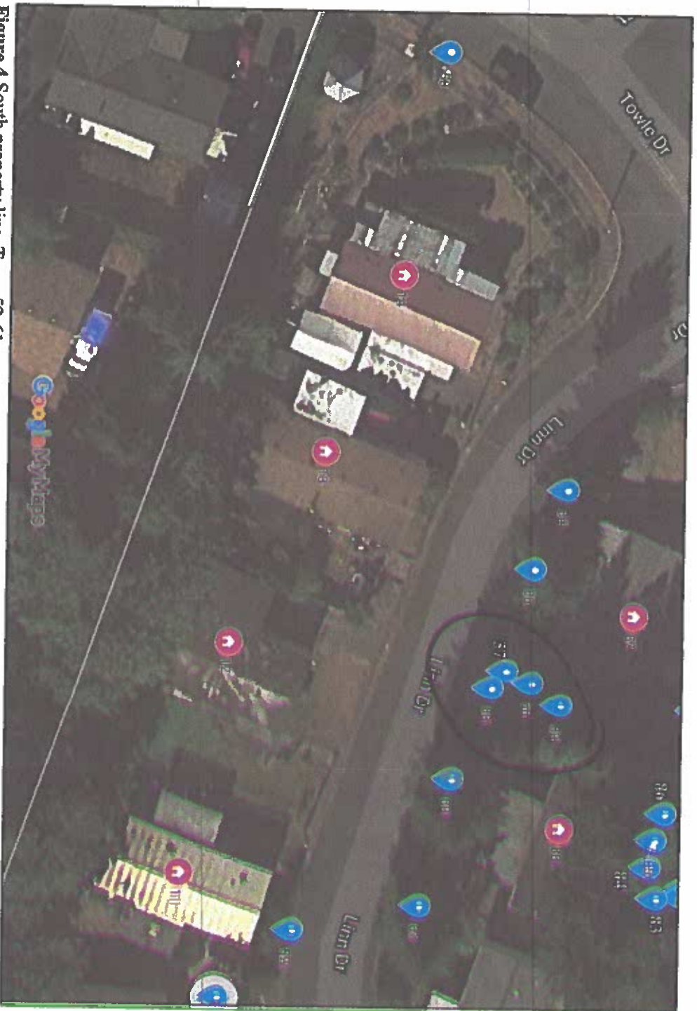
Figure 4 South property line. Trees 52-61.