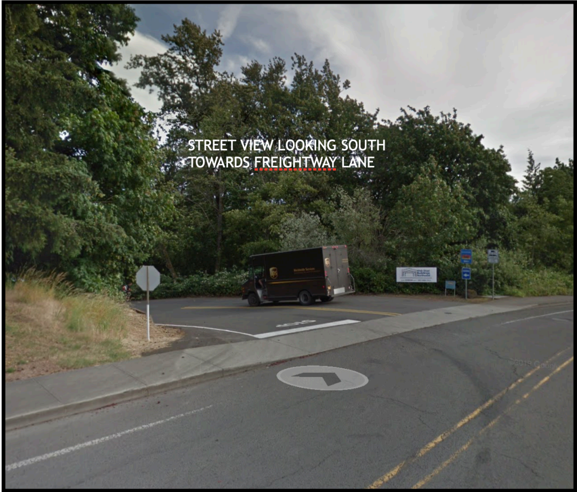
STREET VIEW LOOKING SOUTH TOWARDS FREIGHTWAY LANE