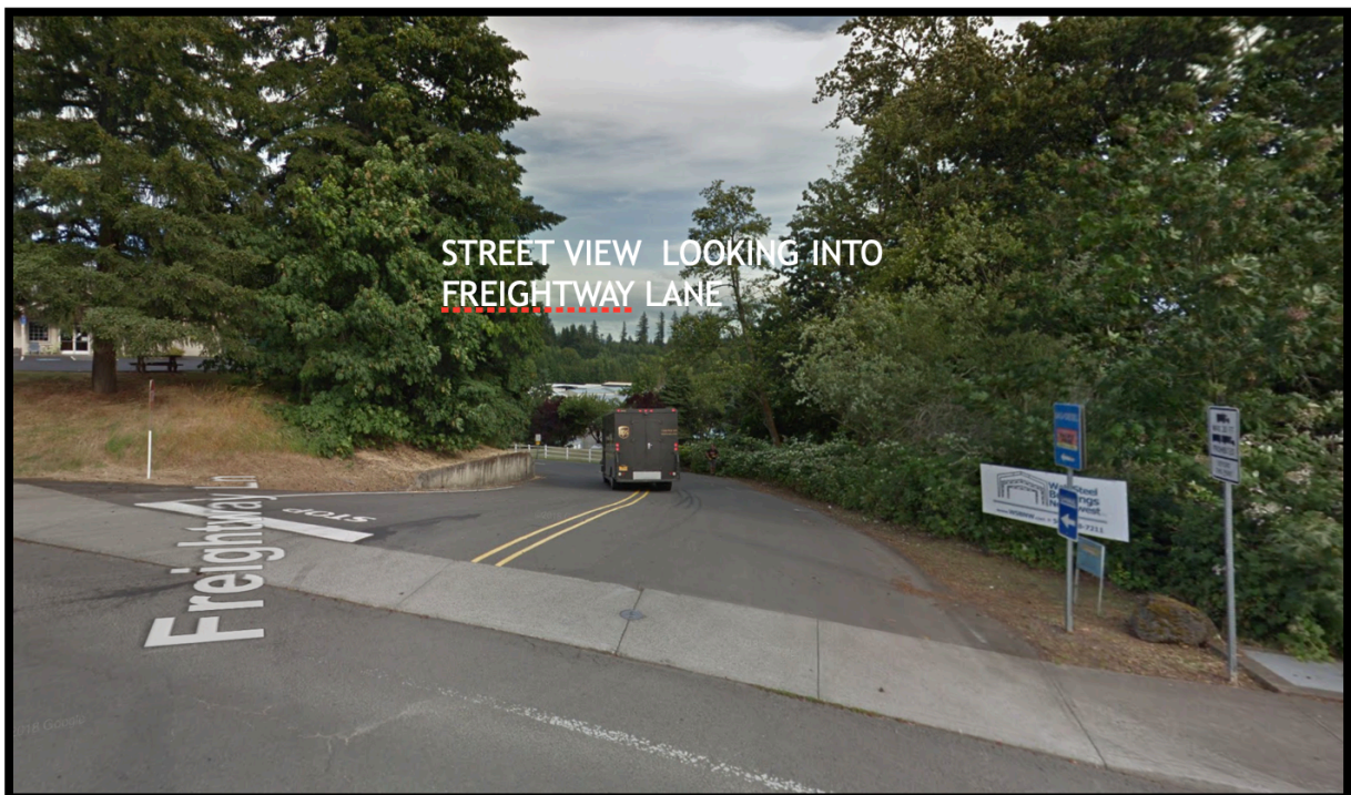
STREET VIEW LOOKING INTO FREIGHTWAY LANE