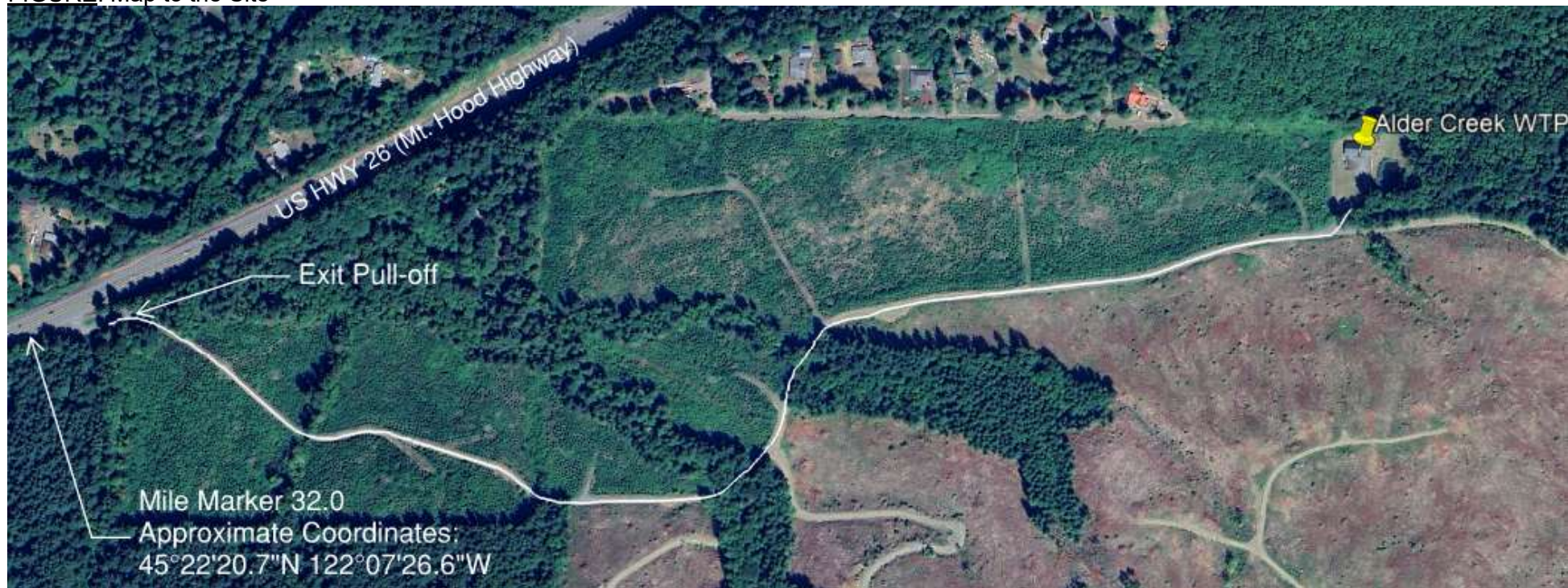
FIGURE: Map to the Site