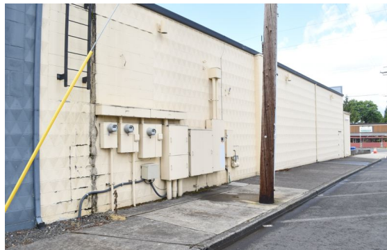
Building owner Brad Picking is in support of covering the back of the complex, which houses Mountain Moka, Mt. Hood Pet Resort, Thrive Fitness and Ascent Physical Therapy, with public art.

To garner funding, Hawley said, "We're looking for ways of raising funds that connect people to the mural."